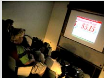
Struggling to Survive screens in Youngstown, OH

• Test the TV and DVD player and familiarize yourself with the DVD navigation, especially if you are going to only show a few films.