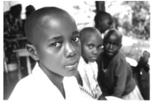
I Promise Africa

Corporate accountability, AIDS, youth activism, civil liberties – MediaRights' fourth annual Media That Matters Film Festival tackles these topics and more. Jury-selected and produced by independent and youth filmmakers from around the country, the Festival's sixteen shorts stream online, tour the country through community screenings, hit the airwaves on cable and satellite television stations and are distributed as a DVD compilation. The goal of our festival is to showcase powerful films that bring important social, political and environmental topics to the forefront. MediaRights encourages the use of these films as a springboard for discussion and more importantly, for action.